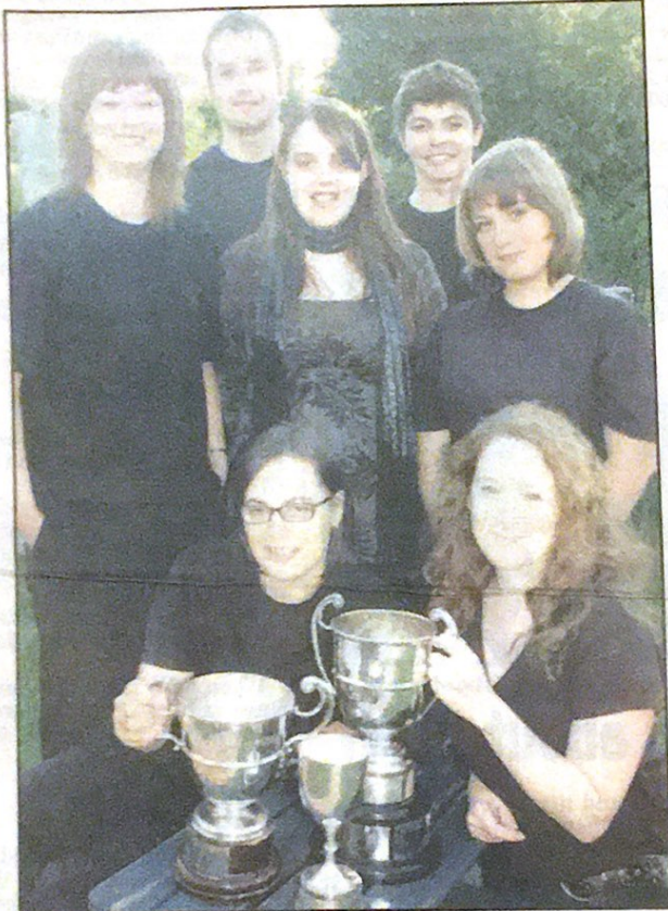
Run At It Shouting with their silverware from Felixstowe.

GIVEN six months to live, a courageous and talented drama teacher fought her illness to direct her last play, but didn't live to see it scoop the top award at a prestigious drama festival last week.